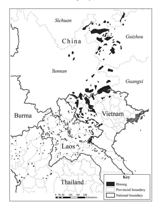
Figure 2. Approximate location of Hmong in Asia.

an educated guess suggests that of the 9.5 million Miao registered in the 2010 China national census (see table 1), about one-third self-identify as Hmong (Lee and Tapp 2010:1; Lemoine 2005).