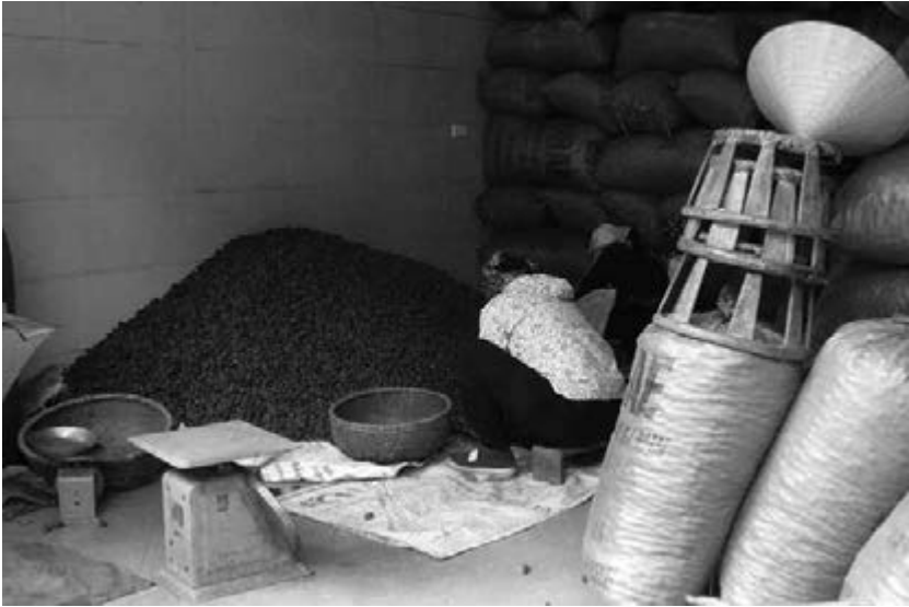
Figure 4 Sorting cardamom for a Kinh wholesaler in Sa Pa town, Lào Cai province