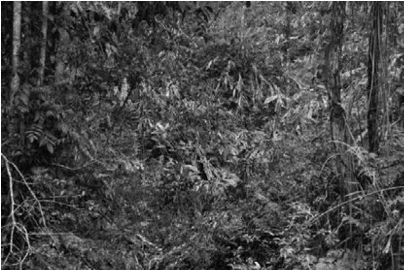
Figure 3 Cardamom recovering from a harsh winter in Bản Khoang Commune, Lào Cai Province, Vietnam

The unpredictable climate in the Sino-Vietnamese borderlands causes yearly yields to fluctuate widely, while natural disasters can also wreak havoc. The maturing fruit can be damaged by extreme weather during the summer rainy season, or due to winter cold spells. Households in Bản Khoang Commune, in Sa Pa District, suffered heavy losses from frost and