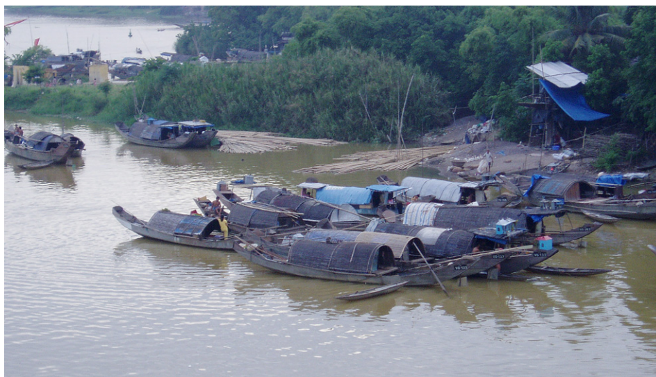
Fig. 2. Sampan and sampan dwellers in Tam Giang Lagoon.

Historically, in Tam Giang Lagoon each family owned their boat, with one family per boat. In turn, every family belonged to a fishing community called a van that could be considered a village or a community of approximately thirty to 50 boats ( Ruddle, 1998 ; Vo and Nguyen, 2000 ). The van system was formed as families grew over generations and established themselves in one designated area, informally regulating fishing by using one type of fishing gear ( Ruddle, 1998 ). Over time however, the van moved from tight knit kinship based relationships, to a group of members of the broader sampan community in a geographic area, loosely based on the same type of fishing gear and family relations ( Ruddle, 1998 ). One might argue then, that the van system provided the sampan dwellers with a form of bonding social capital, and sometimes even bridging as well.