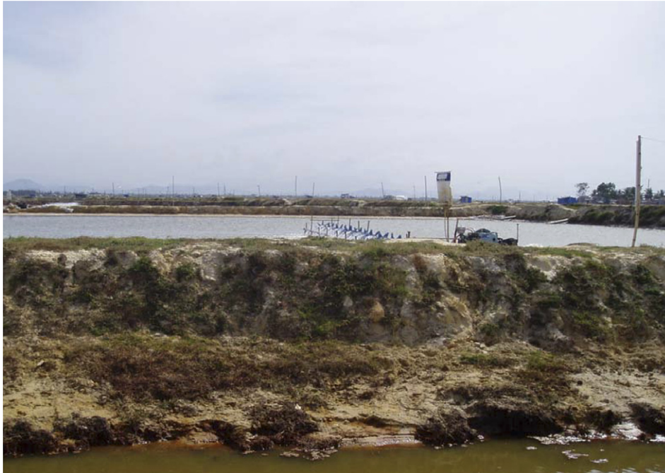
Fig. 3. Aquaculture production in human-made ponds.