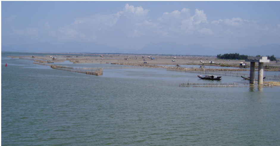
Fig. 4. Aquaculture production in government designated areas of the Tam Giang Lagoon.

to large companies like the ‘Taiwan Company’ located in the area since 1995 (Bui, 2000; Le et al., 2000).