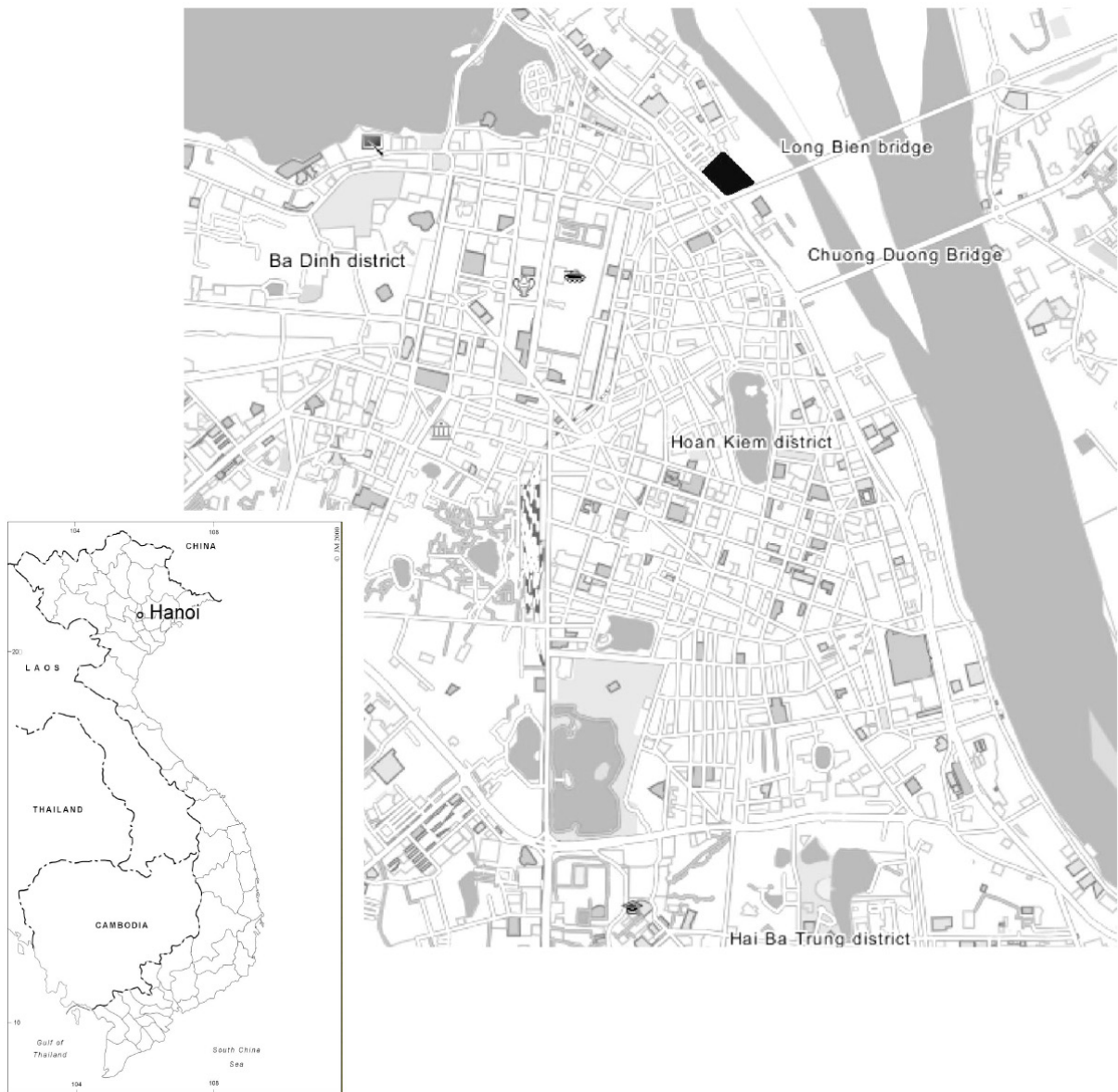
Figure 1. Chợ Long Biên Market (in black) in the heart of Hanoi, Vietnam

residents and act as vibrant distribution hubs. Analyzing the dynamics of urban trade livelihoods based on the sale of fresh produce highlights that actors maintaining these supply routes, like Thần and Giáp , operate in a finely-tuned trading-scape—one that challenges the hegemony of state framing of such food provisioning approaches as pre-modern and inefficient (SRV 2004).