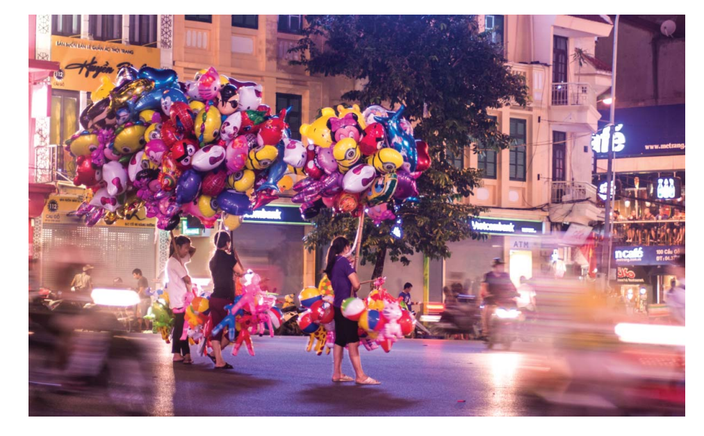
Figure 1. Balloon vendors trading in the middle of a busy and highly regulated intersection on the edge of Hanoi's Old Quarter (a location included in the 2008 ban). (Color figure available online.)

The 2008 ban attempts to foster fluid traffic flow, channeling vendor routes away from sixty-three streets on which vending is prohibited. Signs on the sidewalks and daily announcements over loudspeakers remind vendors to stay clear of these streets. Yet these major thoroughfares are lucrative sites for trade and hubs for foot and vehicle traffic. Itinerant traders thus carefully adjust their daily routes, taking note of which streets and spaces are more frequently targeted by ward officials—including larger, artery roads and those that permit ease of access for police vehicles. In strategic acts of everyday resistance, some vendors continue to trade on